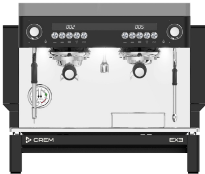
EX3 MINI 2GR DISLAY TA BLACK SMART STEAM