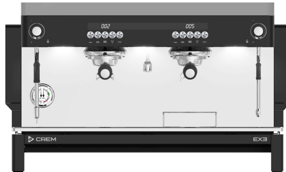
EX3 2GR DISLAY TA BLACK SMART STEAM

The EX3 can be equipped with our well-known SmartSteam, CREM automatic steamer wand solution with an integrated temperature probe to easily froth milk.